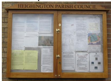
The noticeboard above is from The Pelican Trust and similar to that installed in Stragglethorpe.

The noticeboards in Hough, Brandon and Gelston are in a sorry state. The cheapest replacements are around £350, however the Parish Council has considered the views of some residents that something more in keeping with the Neighbourhood Plan should be considered. More appealing designs are available (see right), but cost £900. The council would like to hear your opinion and ideas – for instance the introduction of a modest fee for businesses to advertise on the boards could be part of a funding option? Please contact your local Councillor with your thoughts.