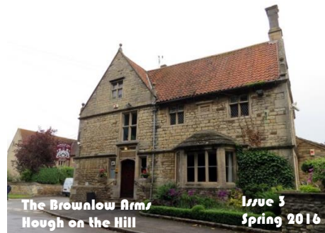
The Brownlow Arms Hough on the Hill

Dog owners be aware it's been reported in the area. It is spread via slugs and snails; www.lungworm.co.uk will tell you symptoms and treatment options.