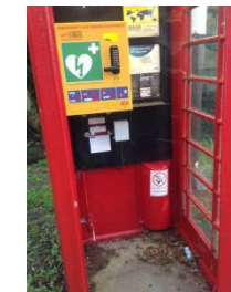
Handy at DIV? The boxes could do with a good clean and a tiled floor would make a big difference. Annual maintenance and a lick of paint within your skills? Contact the village reps'.