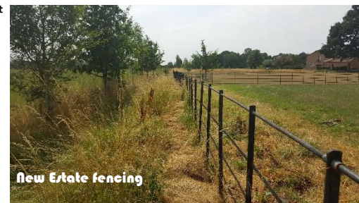
New Estate fencing

Signs will be erected this winter at the junctions with the footpaths (1 and 14) and will advise that the use of the field edge route is not permitted when there is agricultural machinery on the field. They will also ask that walkers remain off the agricultural land and (see elsewhere) control and clean up after dogs.