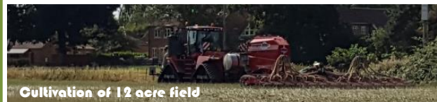
Cultivation of 12 acre field

Permissive Routes – these are 'paths' permitted by a landowner, but are not on the Definitive Map of public rights of way. On designated days these routes are closed and they should be signed to establish their status.