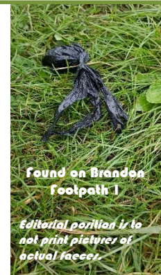
Found on Brandon Footpath 1